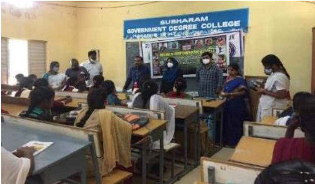
AWARENESS PROGRAMME ON DISHA APP 26-10-2021