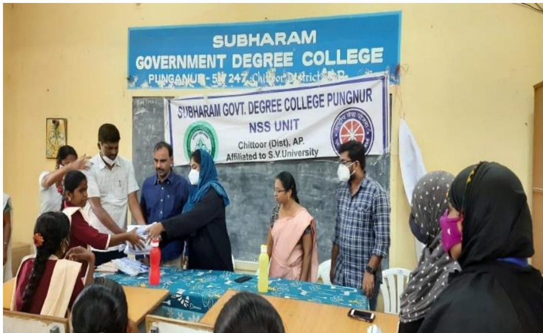
AWARENESS PROGRAMME ON MONTHLY PROBLEMS OF GIRL STUDENTS