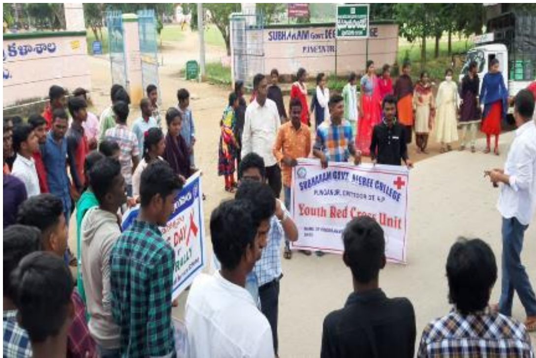
WORLD AIDS DAY 01-12-2021