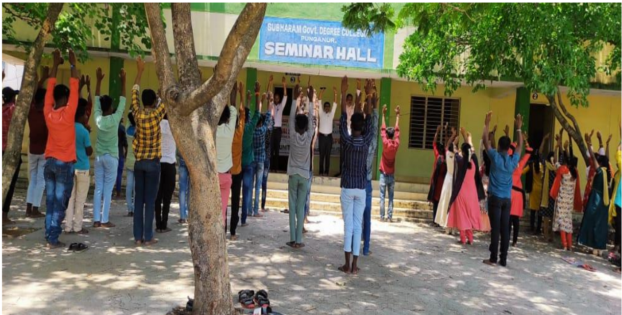
INTERNATIONAL YOGA DAY 21-06-2021