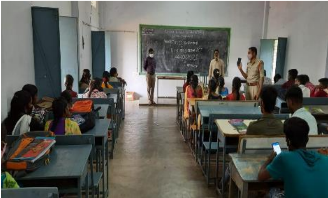
COUNSELLING TO STUDENTS ON EVE-TEASING 26-11-2021